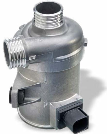
CWA400 – a sample water pump

After installing the new EGR cooler, make sure that the coolant circuit is bled in accordance with the manufacturer's instructions. This prevents air bubbles, so-called hotspots.