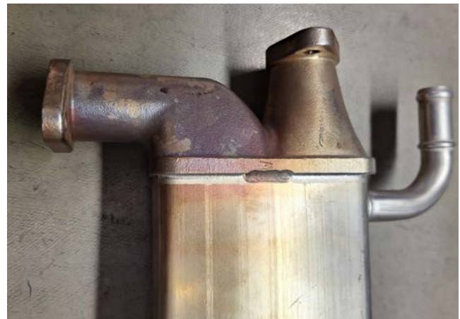
Bubble and crack formation (left) and significant discolourations (right) – typical damage symptoms of thermal overstressing

Motorservice often receives EGR coolers that show signs of thermal damage shortly after installation. This damage is directly or indirectly caused by thermal overload.